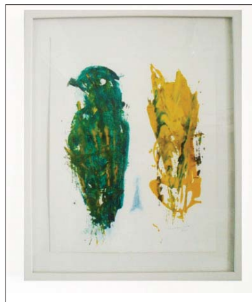
Birds (green & yellow), Acrylic on paper, 21x25 in., 2010. (1-1/8" deep, white wood frame, floated, glass) $2,000.