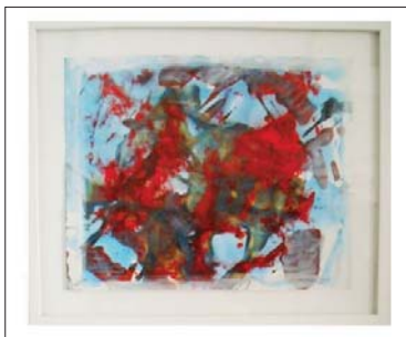
Fury , Acrylic on canvas paper, 25x21 in., 2009. (1-1/8" deep, white wood frame, floated, glass) $1,850.