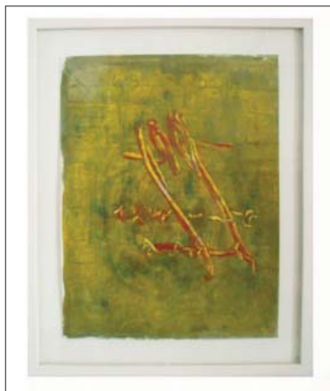
Two Birds, Acrylic on paper, 21x25 in., 2010. (1-1/8" deep, white wood frame, floated, glass) $2,000.