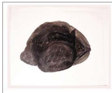
New York Series #39, Acrylic on paper, 33x27 in., 2007. (1-1/8" deep, white wood frame, floated, glass) $2,750.