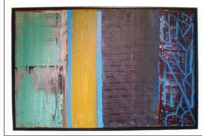
Wall Painting #1, Untitled (red), Acrylic on canvas, 37x25 in., 2007. (2-1/8" deep, black wood frame, floated) $3,600.