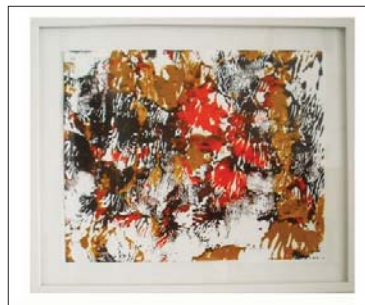
Garden , Acrylic on canvas paper, 25x21 in., 2009. (1-1/8" deep, white wood frame, floated, glass) $1,850.