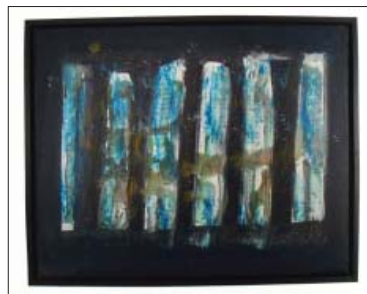
Screens #31, Acrylic on canvas, 21x17 in., 2007. (2-1/8" deep, black wood frame, floated) $2,800.