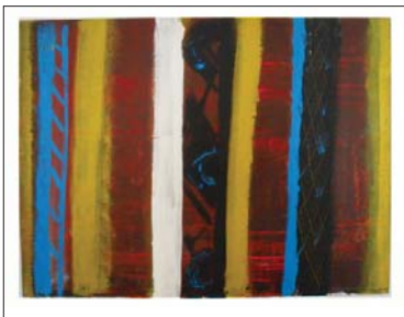
White Screen, Acrylic on canvas, 23.75x18 in., 2007. (unframed) $1,850.