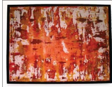
Untitled, Field Acrylic on canvas, 24.75x18.75 in., 2009. (1-1/4" deep, black wood frame, floated) $2,250.