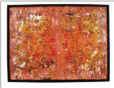
Untitled, Field 2 Acrylic on canvas, 24.75x18.75 in., 2009. (1-1/4" deep, black wood frame, floated) $1,950.