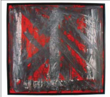
Wall Painting #4, Acrylic on canvas, 25x25 in., 2007. (2-1/8" deep, black wood frame, floated) $3,200.