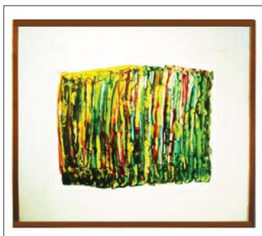
New York Series, Untitled, Acrylic on paper, 36.75x31.25 in., 2007. (natural wood frame, matted, glass) $2,850.