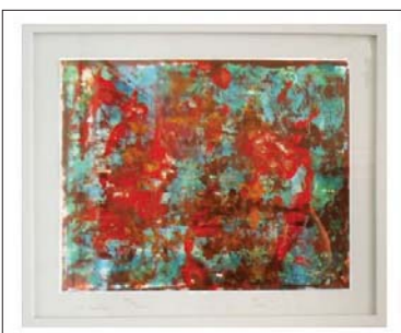
Red Carpet , Acrylic on canvas paper, 25x21 in., 2009. (1-1/8" deep, white wood frame, floated, glass) $1,850.