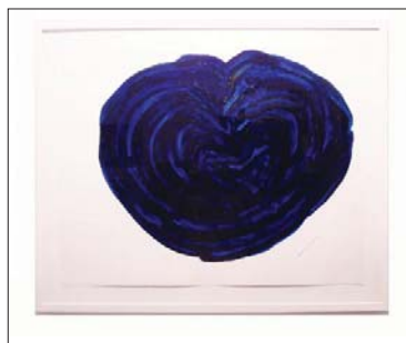
New York Series #35, Acrylic on paper, 33x27 in., 2007. (1-1/8" deep, white wood frame, floated, glass) $2,750.