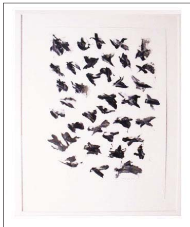
New York Series #73, Acrylic on paper, 25x30.75 in., 2007. (1-1/8" deep, white wood frame, floated, glass) $2,750.