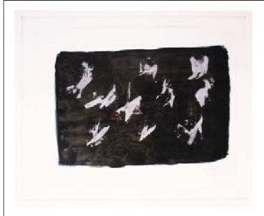
New York Series #47, Acrylic on paper, 33x27 in., 2007. (1-1/8" deep, white wood frame, floated, glass) $2,750.