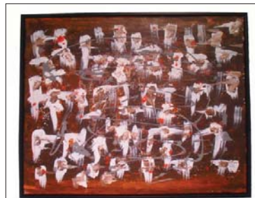
Dollscape , Acrylic on canvas, 20.75x16.75 in., 2009. (1-1/4" deep, black wood frame, floated) $1,950.