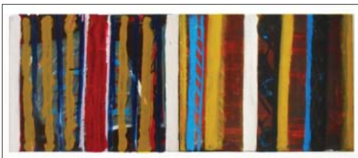
Red & White Screens (as a set) 47.5x18 in., 2007. $3,500.