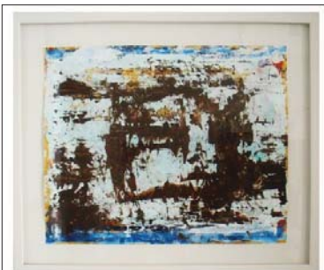
Ruins , Acrylic on canvas paper, 25x21 in., 2009. (1-1/8" deep, white wood frame, floated, glass) $1,850.