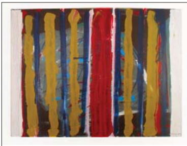
Red Screen, Acrylic on canvas, 23.75x18 in., 2007. (unframed) $1,850.