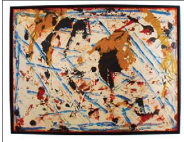
Fugitive , Acrylic on canvas, 24.75x18.75 in., 2009. (1-1/4" deep, black wood frame, floated) $2,250.