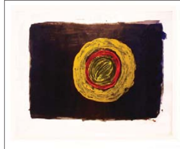
New York Series #34, Acrylic on paper, 33x27 in., 2007. (1-1/8" deep, white wood frame, floated, glass) $2,750.