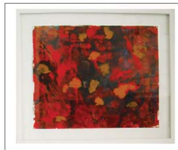
Dreamland , Acrylic on canvas paper, 25x21 in., 2009. (1-1/8" deep, white wood frame, floated, glass) $1,850.