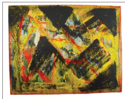
Wall Painting, Untitled (arrows), Acrylic on canvas, 30x24 in., 2007. (unframed) $2,200.