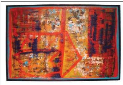
Wall Painting, Untitled (red), Acrylic on canvas, 30.75x20.75 in., 2007. (1-1/4" deep, black wood frame, floated) $3,200.